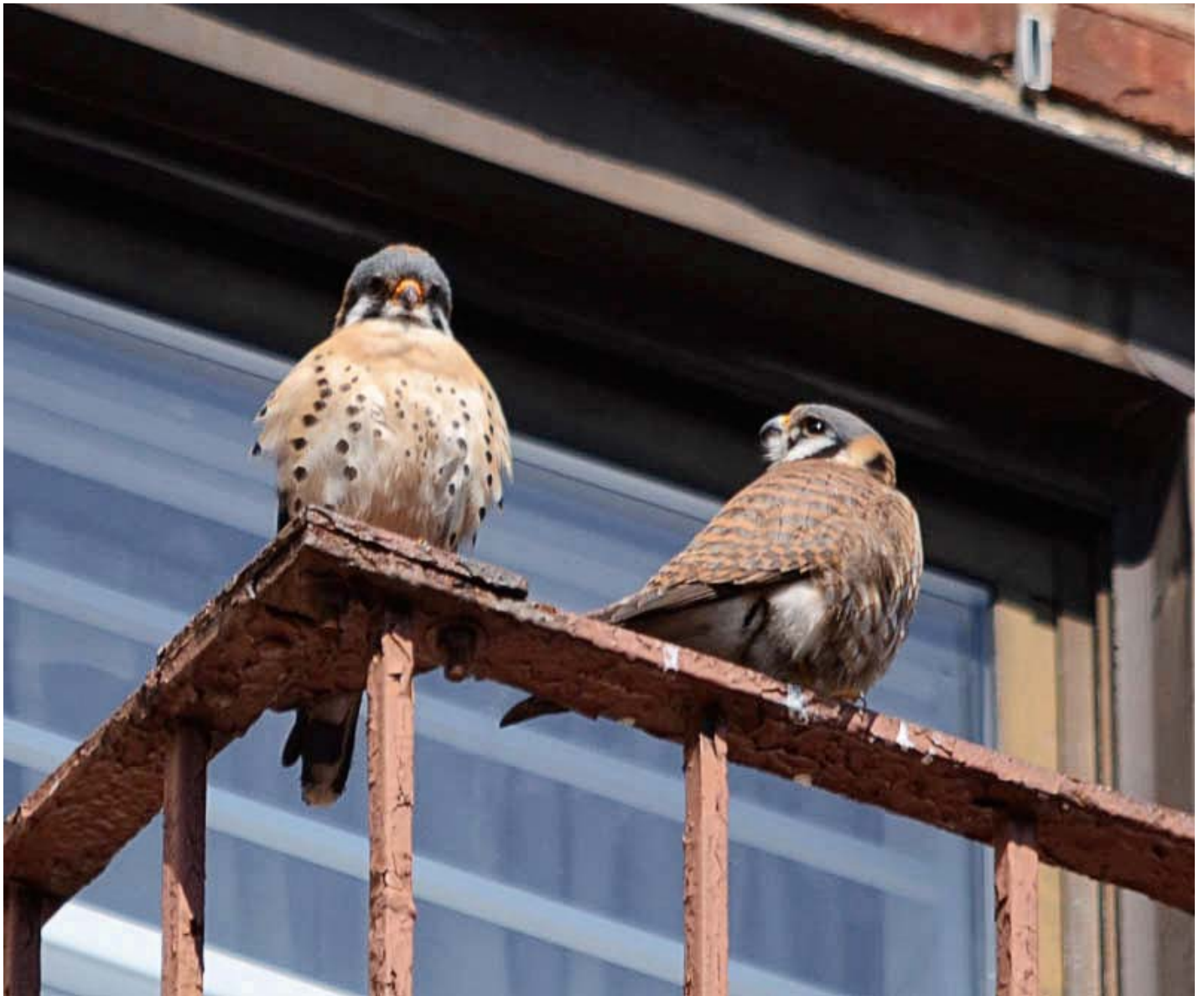
Above: male American Kestrel (left) and female (right) very near their nest site in the Bronx. Photo by Abian Sacks – see his email on the next page (p.5).