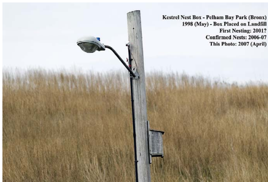
Kestrel Nest Box - Pelham Bay Park (Bronx) 1998 (May) - Box Placed on Landfill First Nesting: 2001? Confirmed Nests: 2006-07 This Photo: 2007 (April)