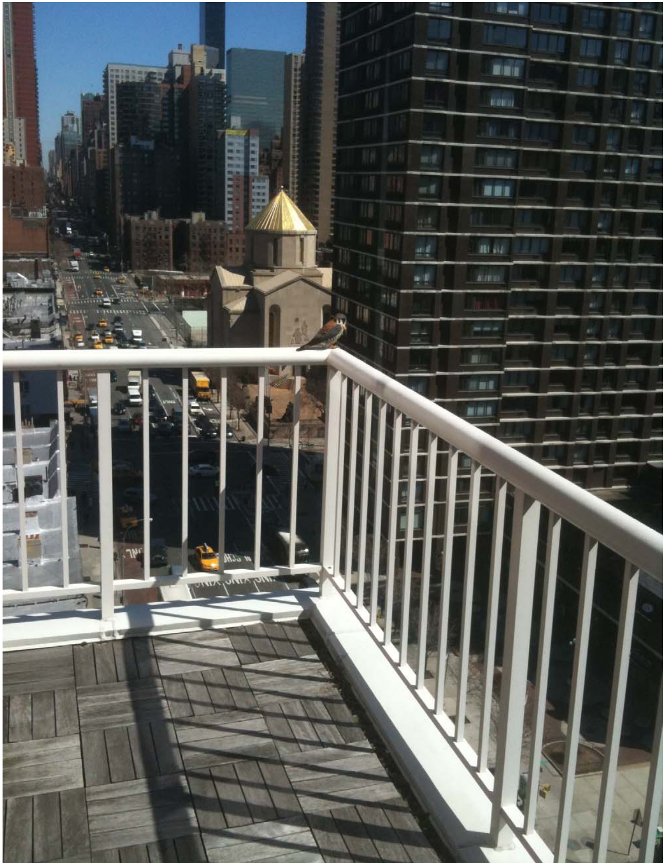
Above: male kestrel on Paul Goldstein's balcony on 32nd Street and 2 nd Ave. The photo is looking north up 2nd Ave - the gold dome church is at 34th by the entrance to the midtown tunnel. We have received reports of kestrels in this area (especially from Lexington Ave east to York Ave). There are many apartment buildings with cornices in that area...great kestrel nesting habitat, as well as House Sparrow habitat. Please find us a nest Rob!