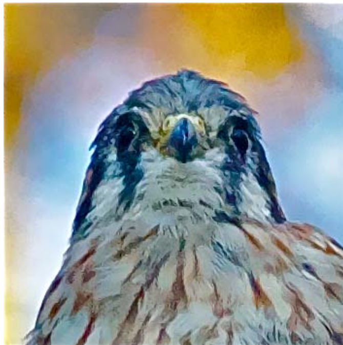
Male American Kestrel