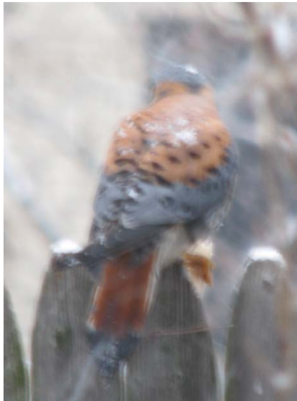
Above: male American Kestrel – Feb 2010 in Greenwich Village

If you see a kestrel perched near your home, there is likely a pair in the area – and a nearby nest.