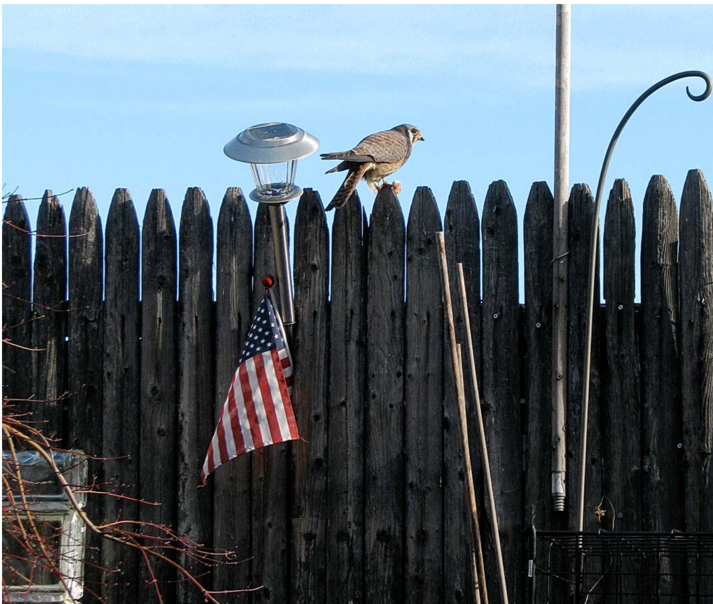
Above: female American Kestrel feeding on a rooftop garden in Greenwich Village (Houston and 6 th area), October 2010. Kestrels are frequent visitors here. See info on following page.

From: JT To: rdcny@earthlink.net Subject: Kestrels in Greenwich Village (Manhattan) Date: 4 April 2011 (Monday)